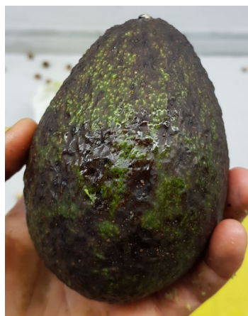
Figure 1: Avocado with fuzzy patches

To improve the quality of New Zealand avocados, it has been identified that AVOCO needs to work both individually and collaboratively across all areas of the supply chain to review and address the elements influencing fruit quality.